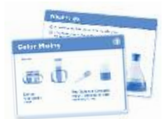
Activity Cards (10)

RISQUE D'ÉTOUFFEMENT. Petites pièces. Interdit aux enfants en dessous de 3 ans. ERSTICKUNGSGEFAHR. Kleine Teile. Nicht geeignet für Kinder unter 3 Jahren. PELIGRO DE ASFIXIA. Piezas pequeñas. No se recomienda para menores de 3 años.